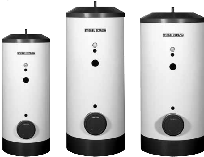
Left to right: SBB 300 SBB 400 SBB 600 Plus